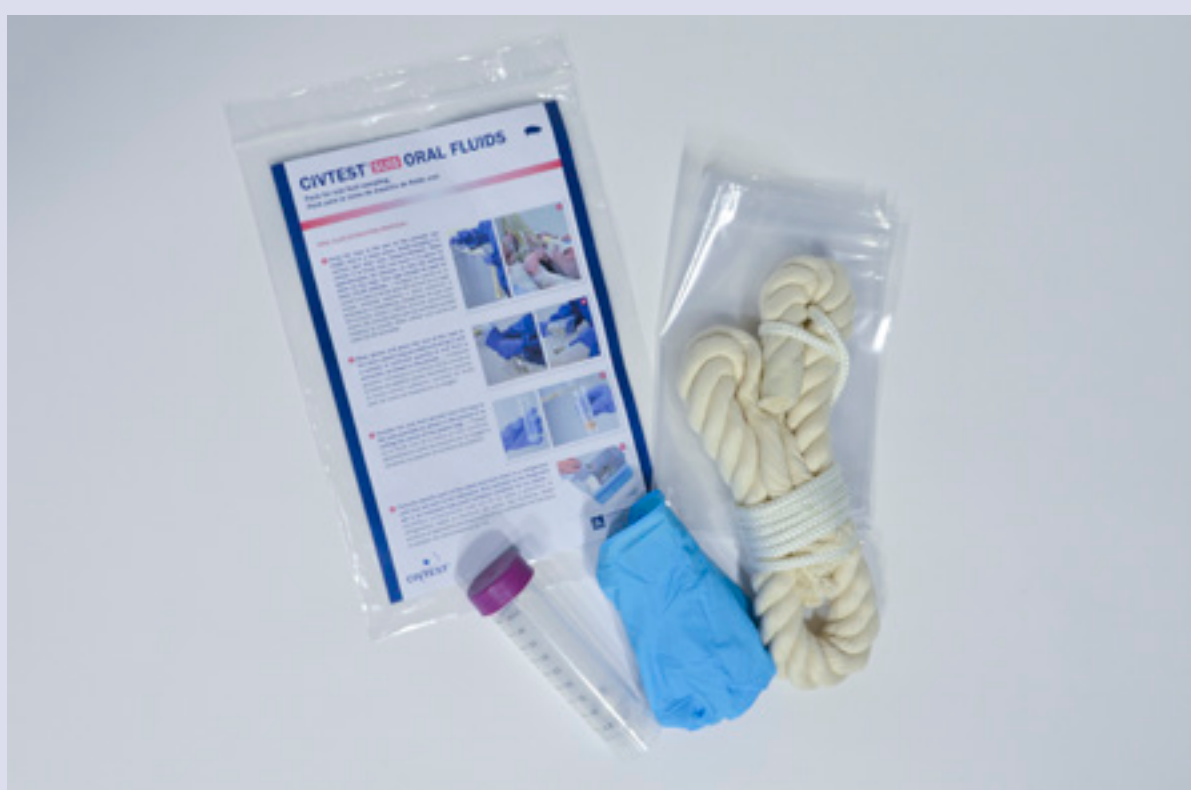
Figure 1. The oral fluid samples were collected with ORALCHECK pack.